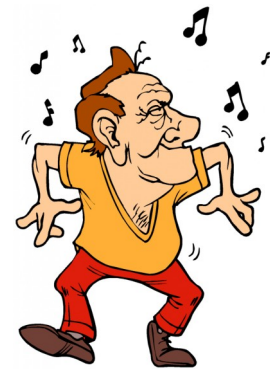
A pun, A two, A three...

Tom Swiftie: "And I really don't like math class," Tom added.